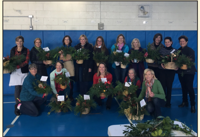
The Perennial Planters

planted paperwhite bulbs that they take to their rooms, waiting in anticipation for them to bloom. FloralCoLab is a design collective of talented area florists who donated their time, talent and materials to show the children how to plant a variety of succulents that needed little care and could be maintained in their living space.