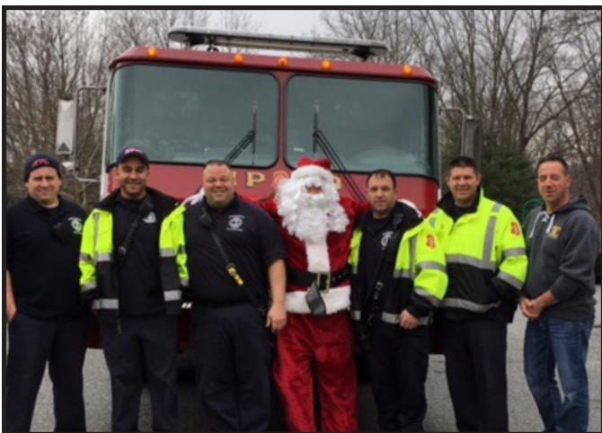
North Providence Fire Department and Santa

Police Department serves lunch to the children. It is nice for the children to visit with these professionals in a non-emergency situation when they can have an opportunity to get to know each other on an informal basis.