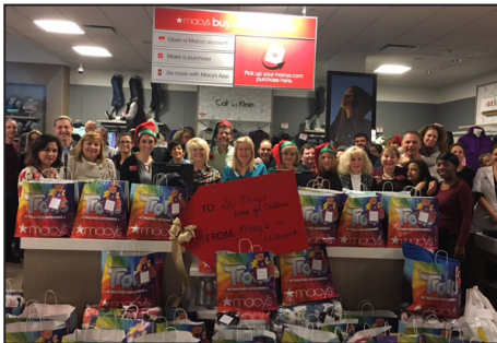
Employees at Macy's in Warwick Mall all became elves this holiday season by sponsoring a giving tree and providing many gifts for the children.

Non-Profit US Postage PAID Providence, RI Permit #11