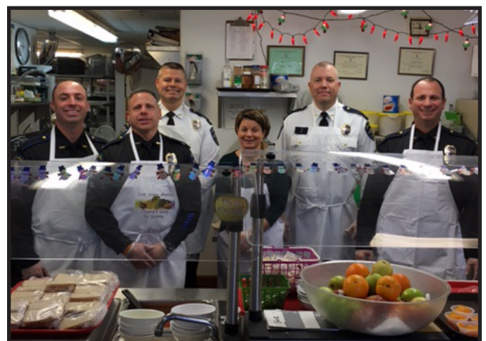
North Providence Police Department

Police Department serves lunch to the children. It is nice for the children to visit with these professionals in a non-emergency situation when they can have an opportunity to get to know each other on an informal basis.