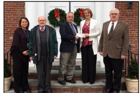
For over 25 years, the Shriners of Rhode Island Charities Trust has generously been supporting our mission and programs.