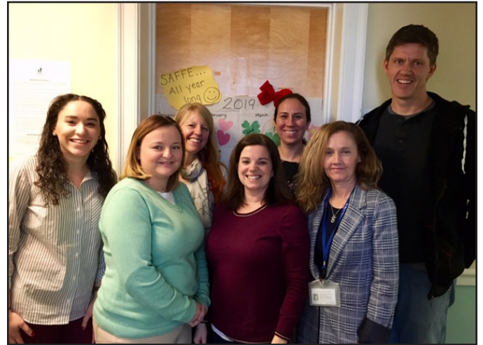
St. Mary's Home for Children's SAFFE Team

each child's unique abilities and needs is used. Some of the clinical techniques utilized include Trauma Focused Cognitive Behavioral Therapy (TF-CBT), Play Therapy, Expressive Therapy, sensory interventions and Equine Assisted Psychotherapy. All of the children in the SAFFE Program are offered a unique opportunity to participate in Equine Assisted Psychotherapy using the EAGALA model. The children in the SAFFE Program are also offered an opportunity to participate in our "Hope for Healing" clinical support groups for