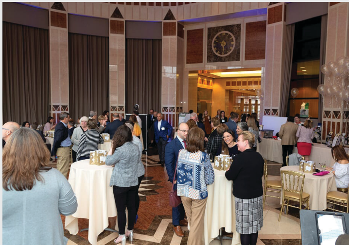
Donors & Friends enjoying our Children's Friendship Award event held on April 11, 2019, which raised $60k in support of treatment and services here at SMHFC.