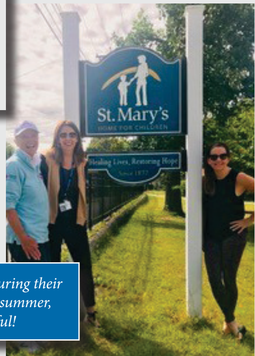
Junior League of Rhode Island Members during their monthly gardening visits throughout the summer, helping to keep our campus beautiful!